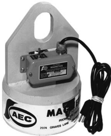
LCR TYPE LIFT HAS THE MANUAL POWER SUPPLY WITH AN "ON-OFF-RELEASE" SWITCH MOUNTED DIRECTLY ON THE MAGNET