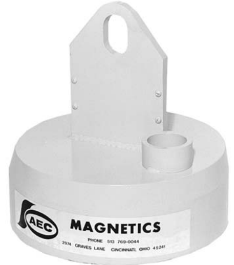
LC TYPE LIFT UTILIZING A REMOTE POWER SUPPLY